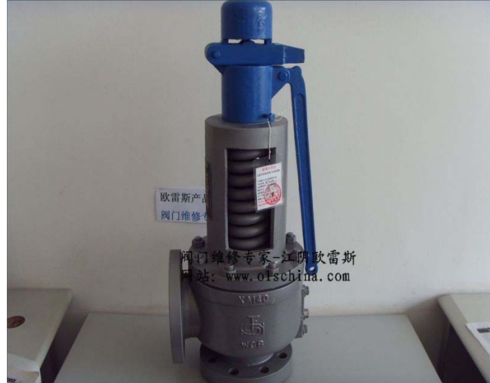
Valve repair electric