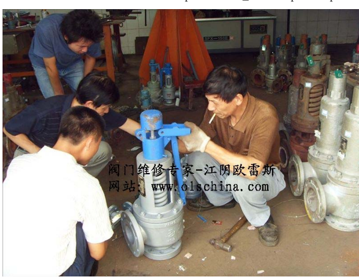
Safety valve repaired