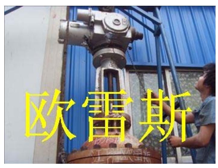
The implementation of the connector valve repair