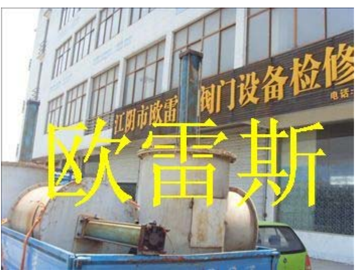
Safety valve maintenance before