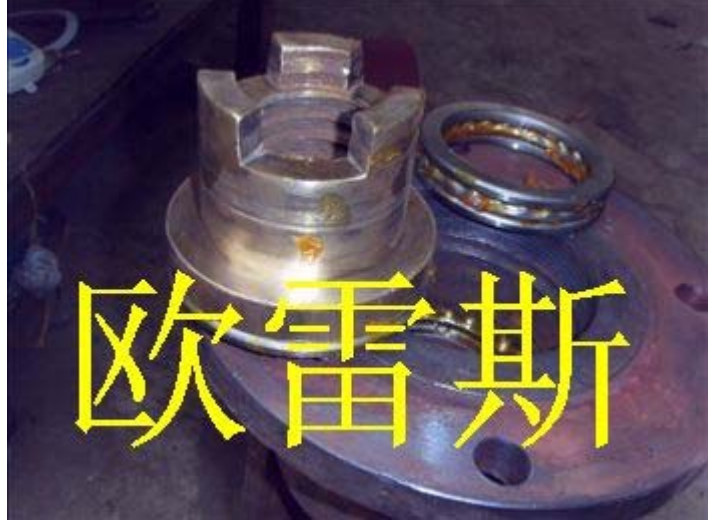
Welded butterfly valve repair